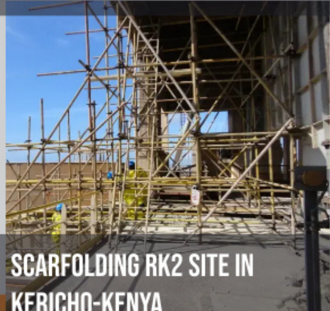
SCAFFOLDING RK2 SITE IN KERICHO-KENYA