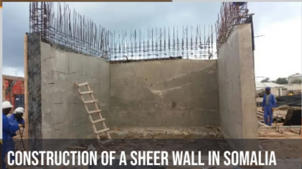
CONSTRUCTION OF A SHEER WALL IN SOMALIA