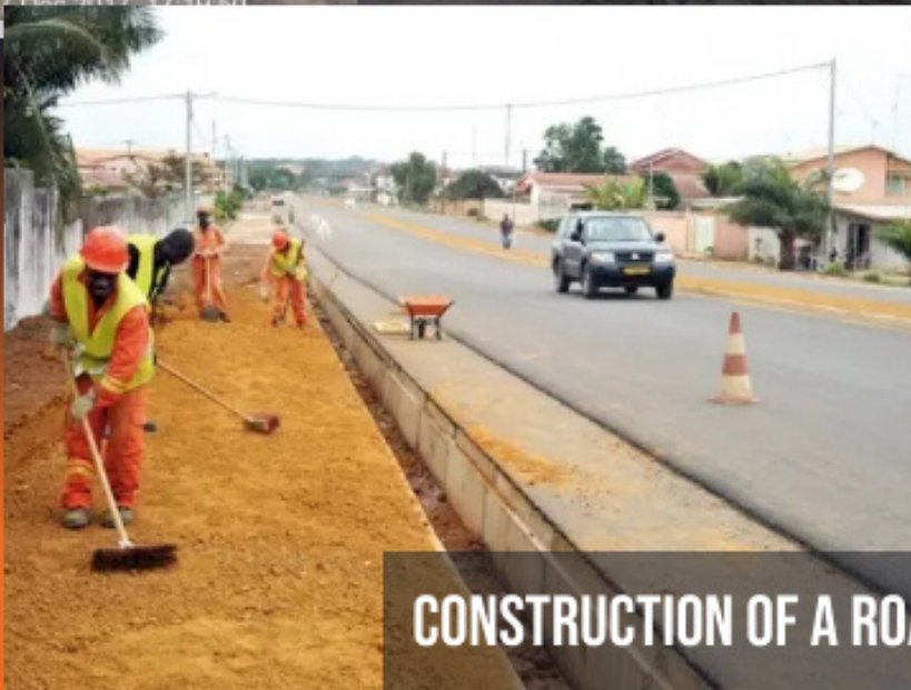
CONSTRUCTION OF A ROAD IN KILIFI