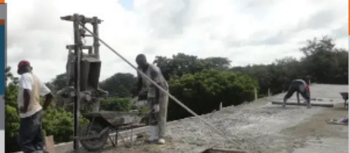
CONSTRUCTION WORK IN SYOKIMAU - KENYA