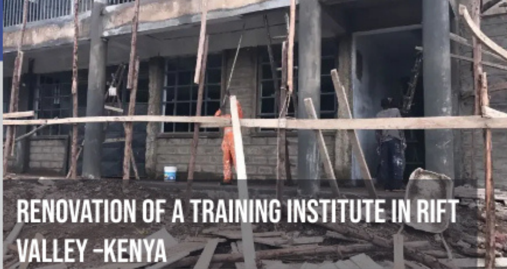
RENOVATION OF A TRAINING INSTITUTE IN RIFT VALLEY -KENYA

SOME OF THE PROJECTS UNDERTAKEN BY SANDLER ENGINEERING SOLUTION