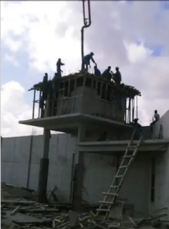
CONSTRUCTION OF REINFORCED CONCRETE WALL AND WATCH TOWER IN SUDAN

SOME OF THE PROJECTS UNDERTAKEN BY SANDLER ENGINEERING SOLUTION