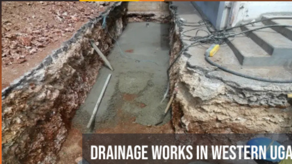
DRAINAGE WORKS IN WESTERN UGANDA