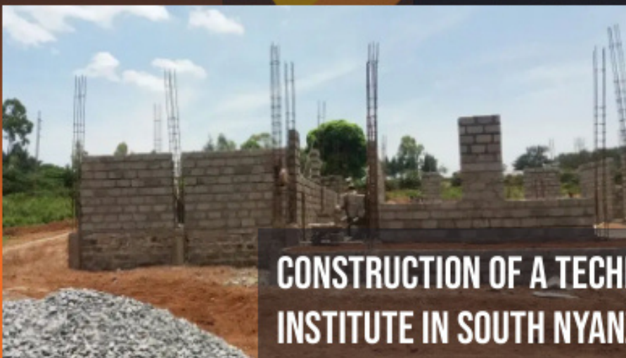
CONSTRUCTION OF A TECHNICAL TRAINING INSTITUTE IN SOUTH NYANZA- KENYA