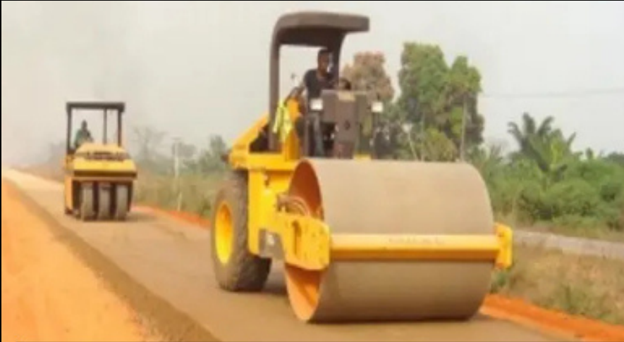
ROAD CONSTRUCTION IN KIAMBU -KENYA

SOME OF THE PROJECTS UNDERTAKEN BY SANDLER ENGINEERING SOLUTION